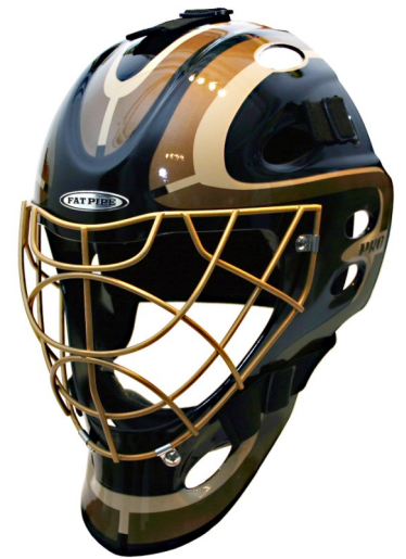
Fat Pipe Pro Helmet Nenonen Ville, 5D muotoilutoimisto Oy