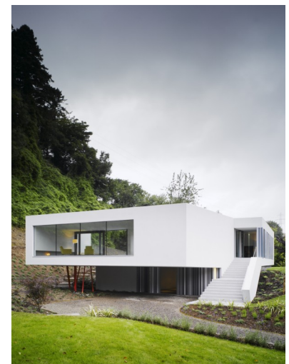
Private Dwelling, Maytree, Co . Wicklow